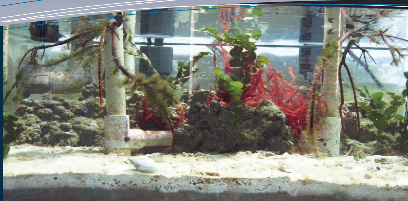
Ping— September Picture of The Month Winner